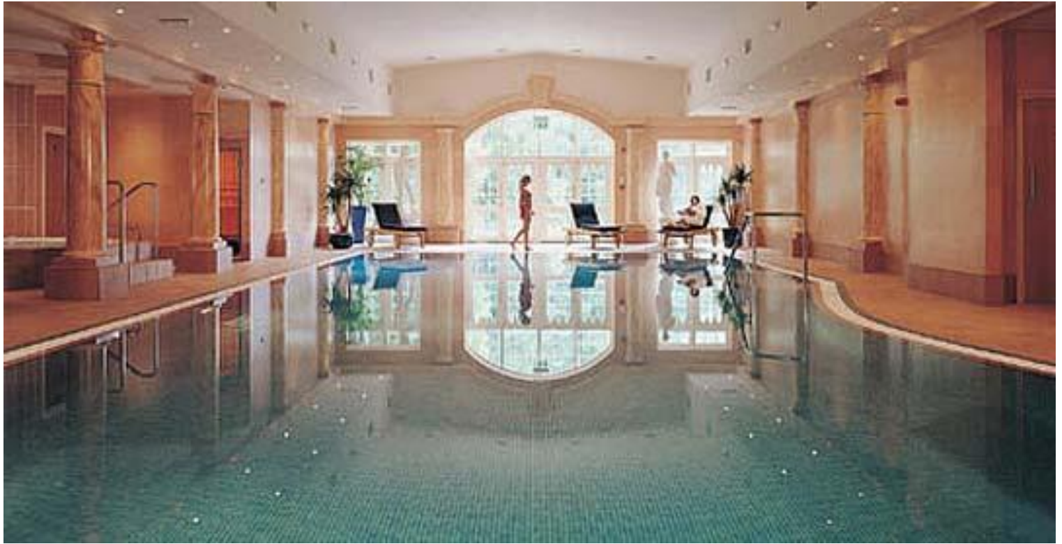
SPA AT CRABWALL MANOR